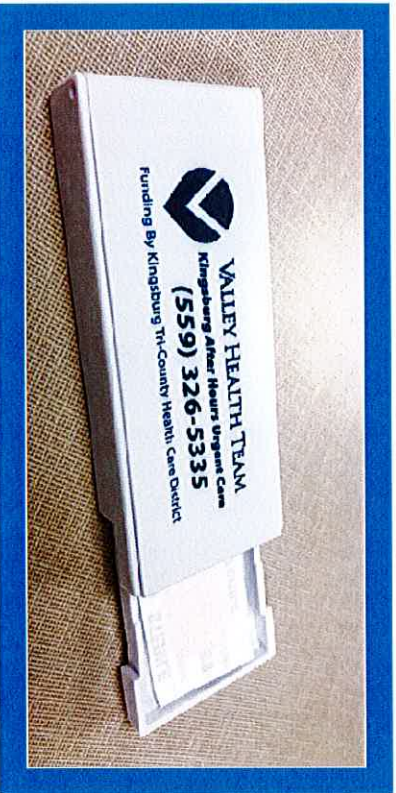
First Aid Box